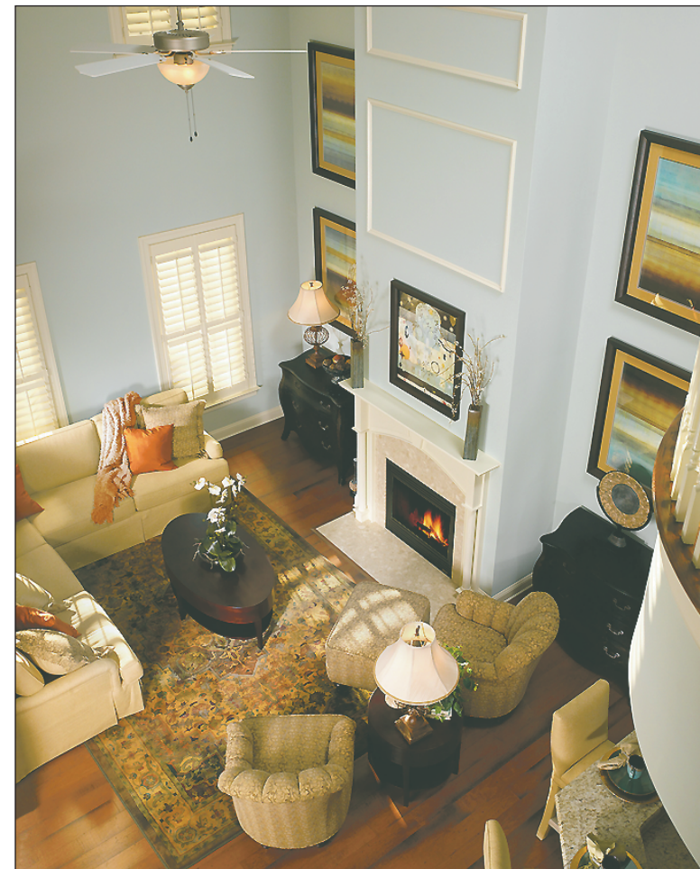
Brightwood Trails features cottage-style homes priced from the $160,000s to the low $200,000s.

Completing the streetscape is the installation of a handsome landscaping package with every home.