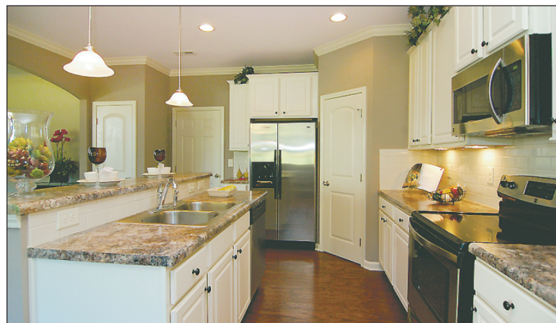
Aristokraft kitchen cabinets with cabinet crown molding, and 9-ft. smooth ceilings are just a few of the details included.

For information, call (919) 381-6371 or visit www.winstarhomes.com .