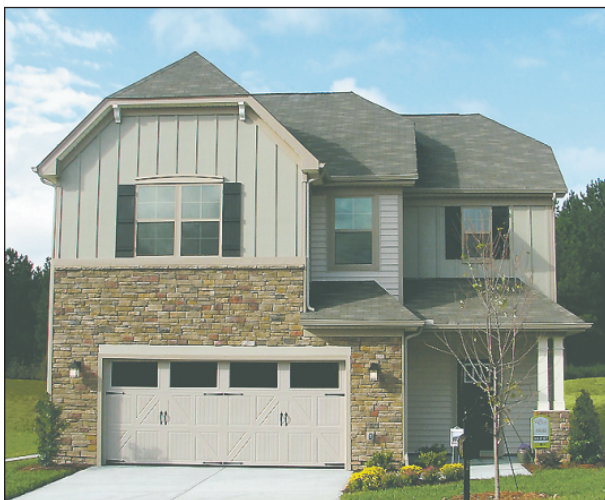
Brightwood Trails features cottage-style homes priced from the $160,000s to the low $200,000s.