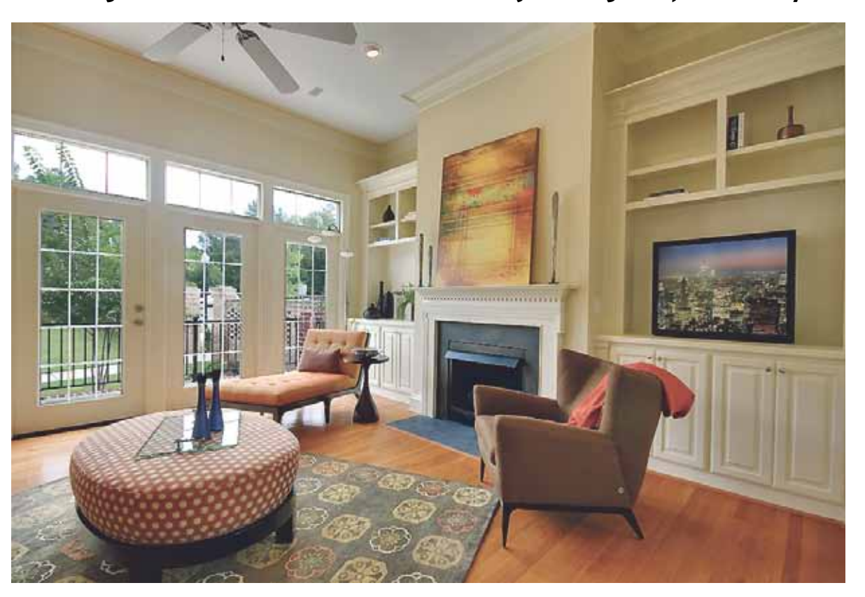
Interiors in Windsor Commons include granite kitchen countertops, custom cabinetry, state-of-the-art appliances, hardwood floors, ceramic tile and 9-foot smooth ceilings.

"The post office, grocery store, drug store and movie theatre are all within walking distance, as well as the new library and a host of great restaurants," adds Broker Patty